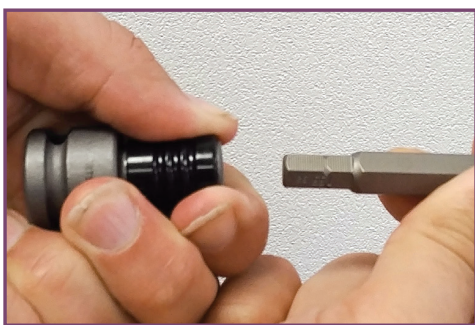
Simple push down motion allows for fast and easy bit change outs.